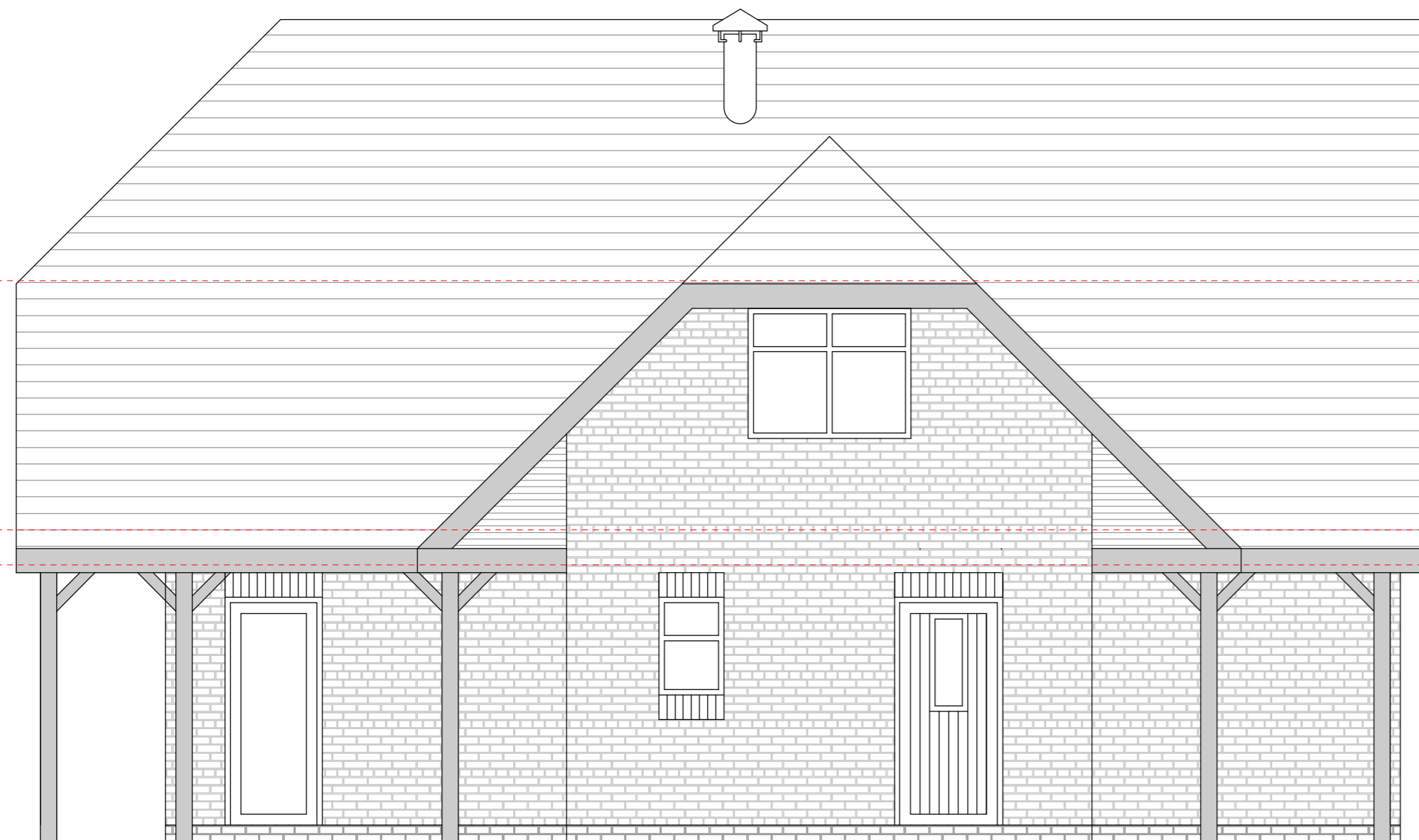
East Facing Elevation