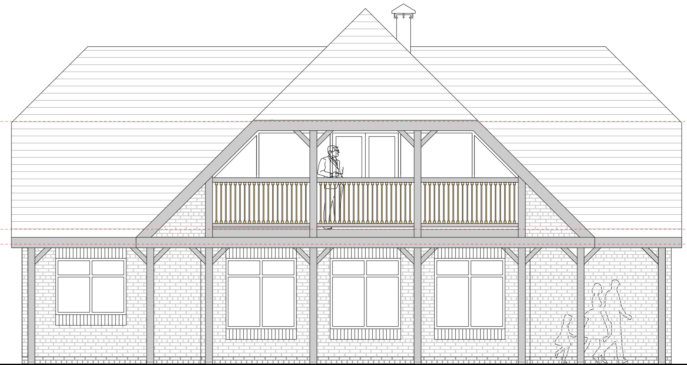
South Facing Elevation