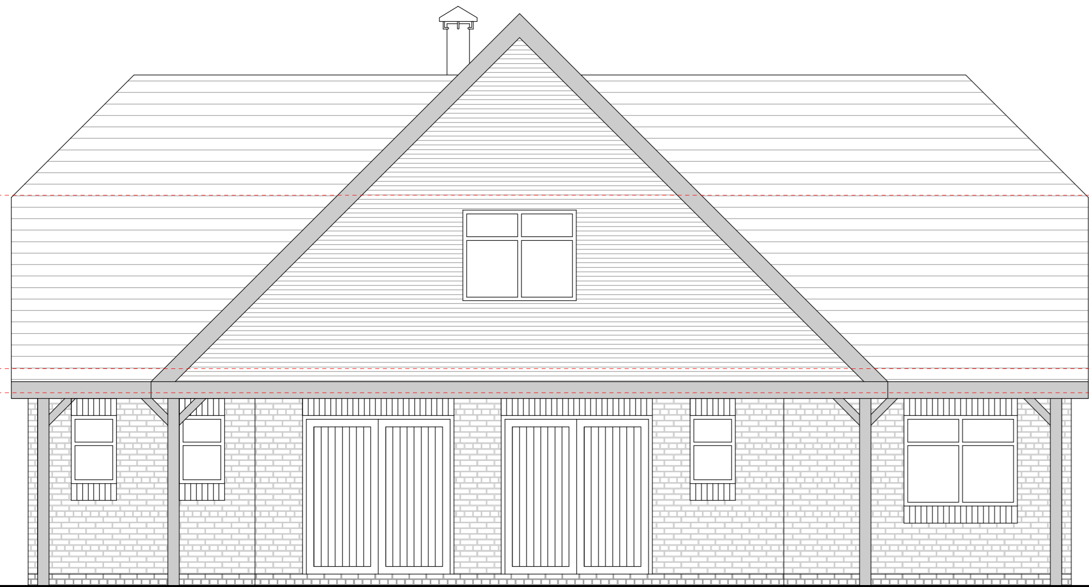
North Facing Elevation